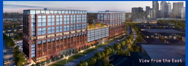
View from the East